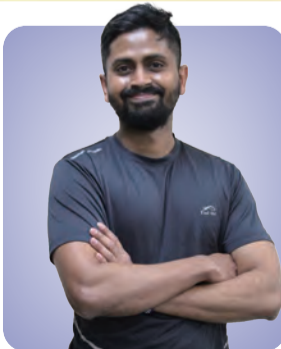
From Sri Lanka

I love maiko and dream of wearing a kimono someday! I am studying Japanese hard every day so that I can pass the Japanese Language Proficiency Test Level 2 this year. My favorite Japanese food is tempura, especially pumpkin tempura!